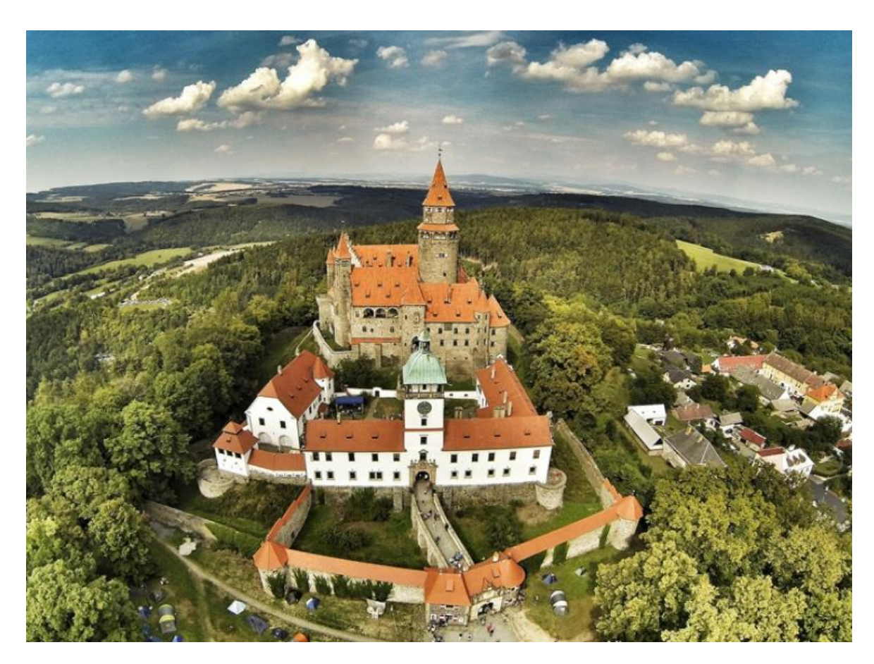
Nice castle Bouzov

15:30 - 19:00 - Sprint Final - Mohelnice